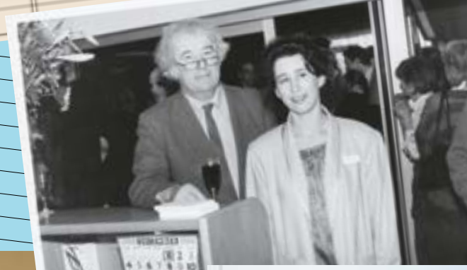
Poetry Library on the South Bank - London

2 2 1989 2073 9 1990 6974 ST 6 1993 48 27 1994