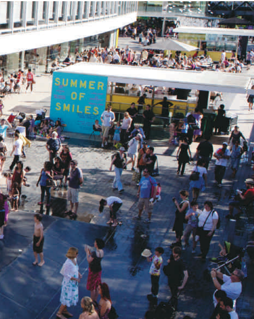
Above: Southbank Centre's Riverside Terrace during the Festival of Britain 60th anniversary celebrations.

concert going – and become repeat visitors to the wider site.