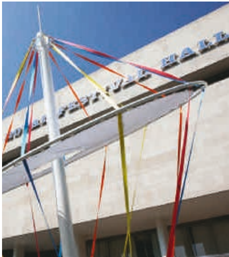
Above: The bandstand, Southbank Centre Market Square. Designed by RIBA London architecture students as part of the Festival of Britain 60th anniversary celebrations.