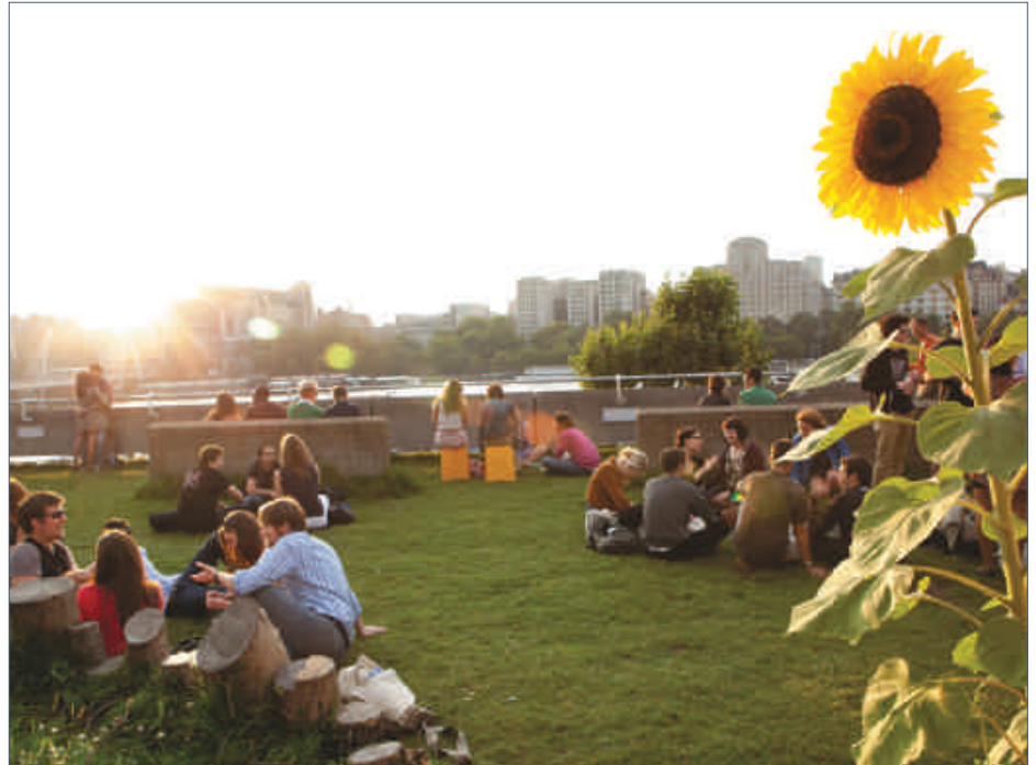
Above right: The Roof Garden at Queen Elizabeth Hall.

MasterCard Russell-Cooke Solicitors Shell Sotheby's The Book People