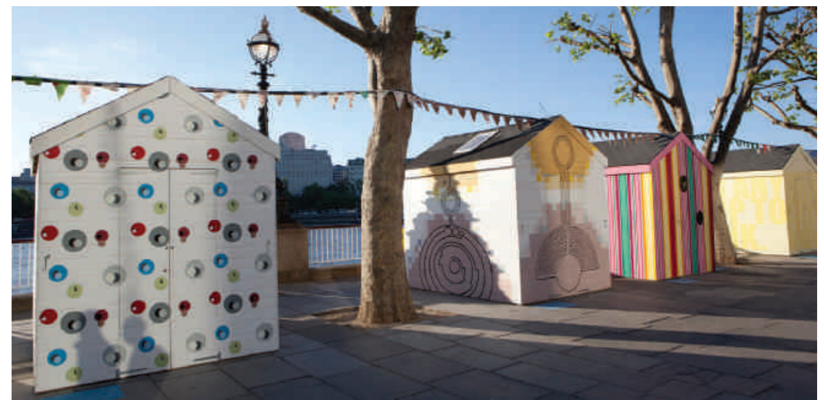
Above right: Beach huts designed by artists, poets, comedians and others.