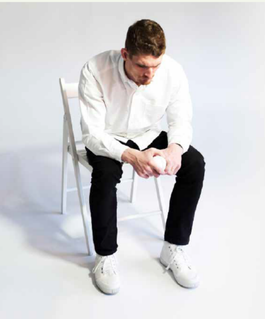
© Julia Bauer © Graham Adey