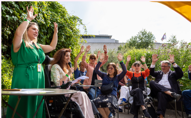
Below: Celebratory event for Art by Post: Poems for our Planet