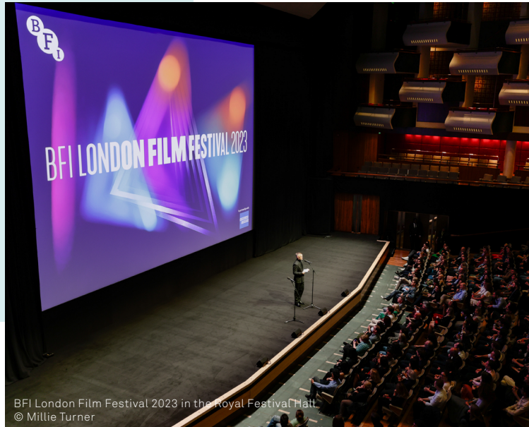
BFI London Film Festival 2023 in the Royal Festival Hall

This year, we again hosted the BAFTA Film, Television and Video Games Awards, as well as the BFI Film Festival and multiple world premieres.