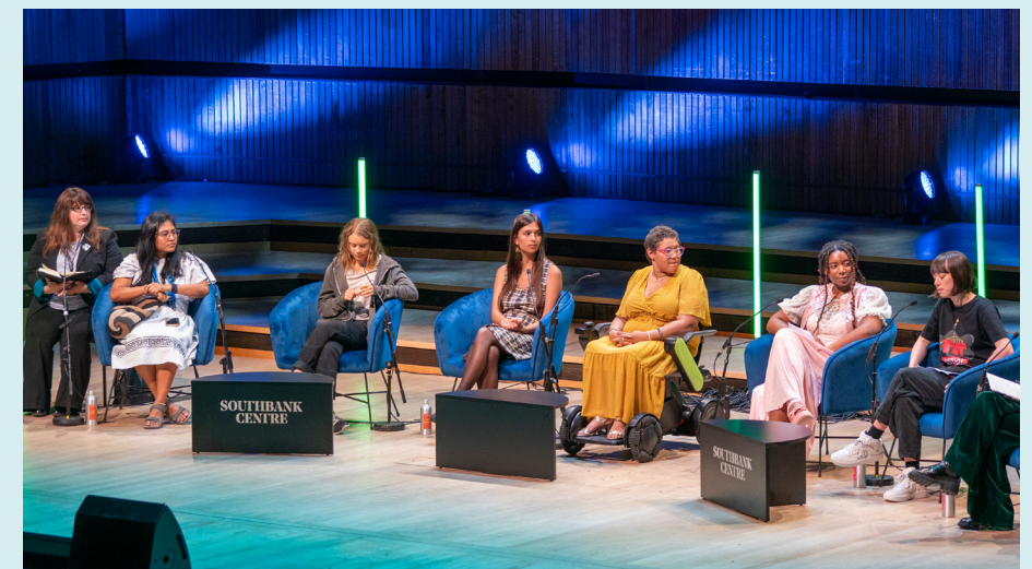
Below: The Climate Conversation , a discussion with young climate leaders including Greta Thunberg during Planet Summer