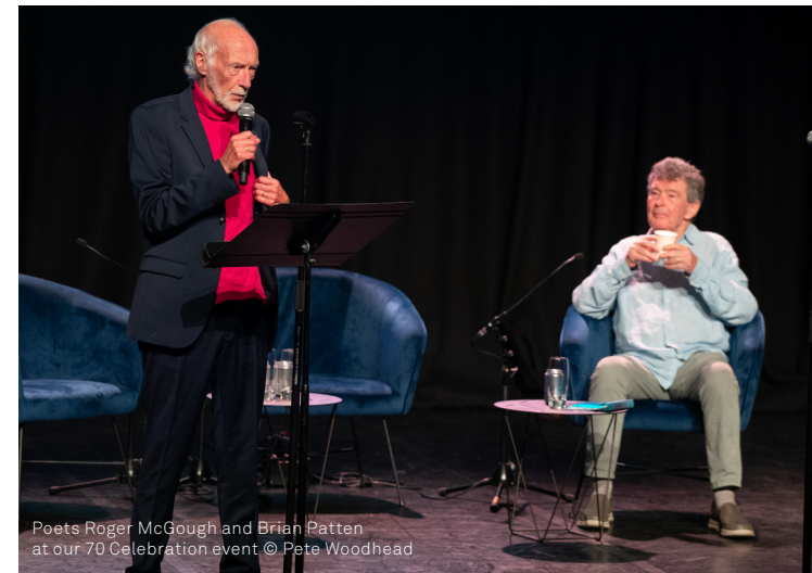
Poets Roger McGough and Brian Patten at our 70 Celebration event

We collaborated with Underbelly to co-produce Drew McOnie's Nutcracker in the former Spiritland restaurant space. The space was transformed into an intimate jazz club for the occasion.