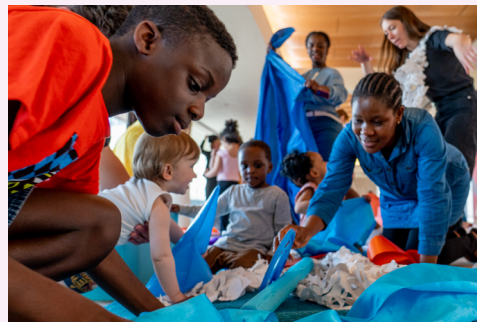
Above: Children and parents at our REPLAY installation

children attended our Imagine Children's Festival