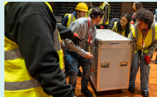
Opposite: Reframe: The Residency exhibition

400+ individuals supported through our Talent & Artist Development programme