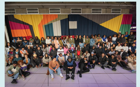
Below: Reframe: The Residency cohort