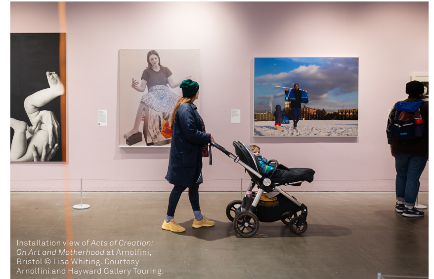
Installation view of Acts of Creation: On Art and Motherhood at Arnolfini, Bristol

Acts of Creation: On Art and Motherhood , a Hayward Gallery Touring exhibition, was launched at Arnolfini Bristol in March 2024 before commencing a national tour.