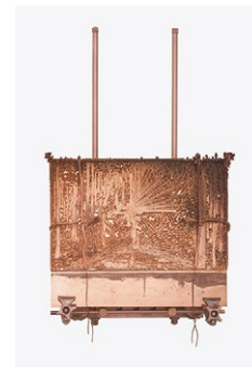
Matthew Barney, Kill Site: State five , 2018. Electroplated copper plate with cast copper wall mount. © Matthew Barney, courtesy Gladstone Gallery, New York and Brussels

Copper and brass, an alloy of copper and zinc, feature prominently in Barney's sculptures and electroplated engravings, which combine traditional casting methods and digital technologies. In Redoubt , the Engraver draws on the asphaltum-covered copper with a sharp engraving tool. Using tanks of copper sulphate and sulphuric acid, the Electroplater then uses an electrical current to draw ions from a copper bar onto the plates. This process has wide industrial applications such as the copper-plating of bullets, but here it takes on the quality of alchemical experimentation. The United States is the world's second-largest producer of copper. Copper deposits have been found throughout the Rocky Mountains and the metal was once mined in the area of central Idaho where the film was shot.