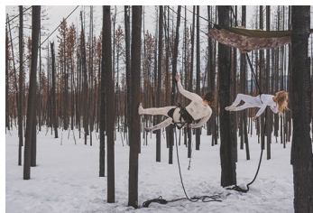
Matthew Barney, Redoubt, 2018. Production still. © Matthew Barney, courtesy Gladstone Gallery, New York and Brussels, and Sadie Coles HQ, London.

The Sawtooth Mountain region is home to dense evergreen forests of lodgepole pines. These tall, narrow-crowned trees are native to the inland northwestern United States and are so called because they were once used by indigenous people as lodge and tipi supports. In Redoubt , the trees' verticality connects the earth to the sky, in particular during a scene when one of Diana's companions (the Calling Virgin) climbs a tall, burned pine. Lodgepole pines are a fire-dependent species – the extreme heat of forest fires melts the resin that encases the cones, releasing the seeds – and their tall, thin trunks have evolved as