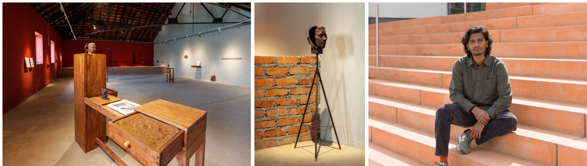
CREDITS IN NOTES TO EDITORS