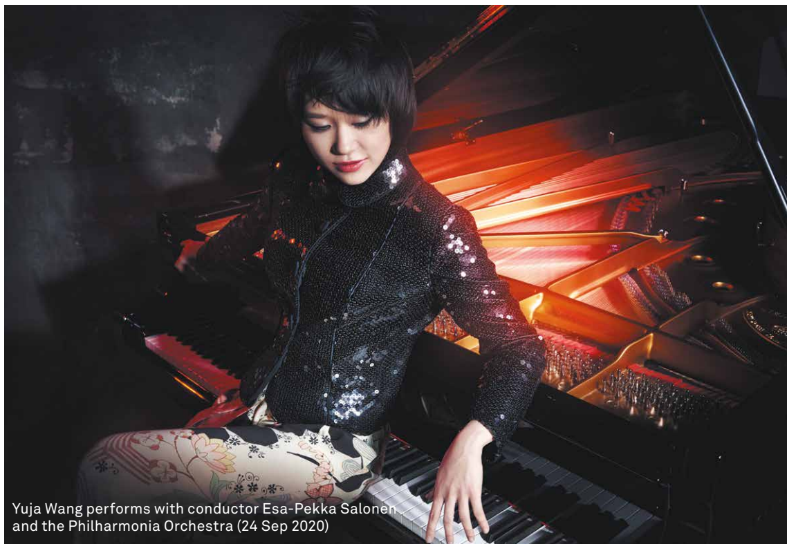
Yuja Wang performs with conductor Esa-Pekka Salonen and the Philharmonia Orchestra (24 Sep 2020)