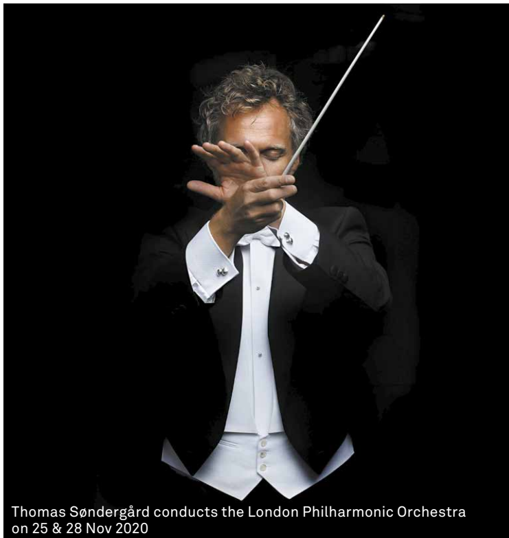
Thomas Søndergård conducts the London Philharmonic Orchestra on 25 & 28 Nov 2020