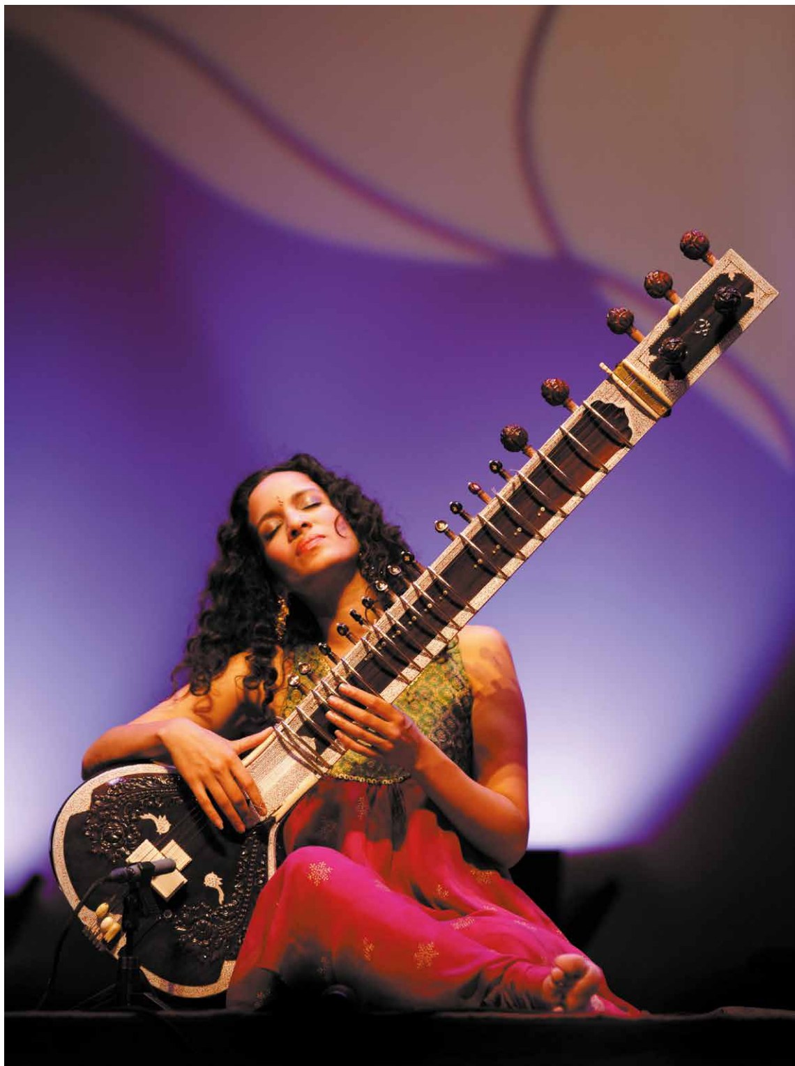
Associate Artist Anoushka Shankar performs with conductor Zubin Mehta and the London Philharmonic Orchestra as part of Shankar 100 (18 Nov 2020)