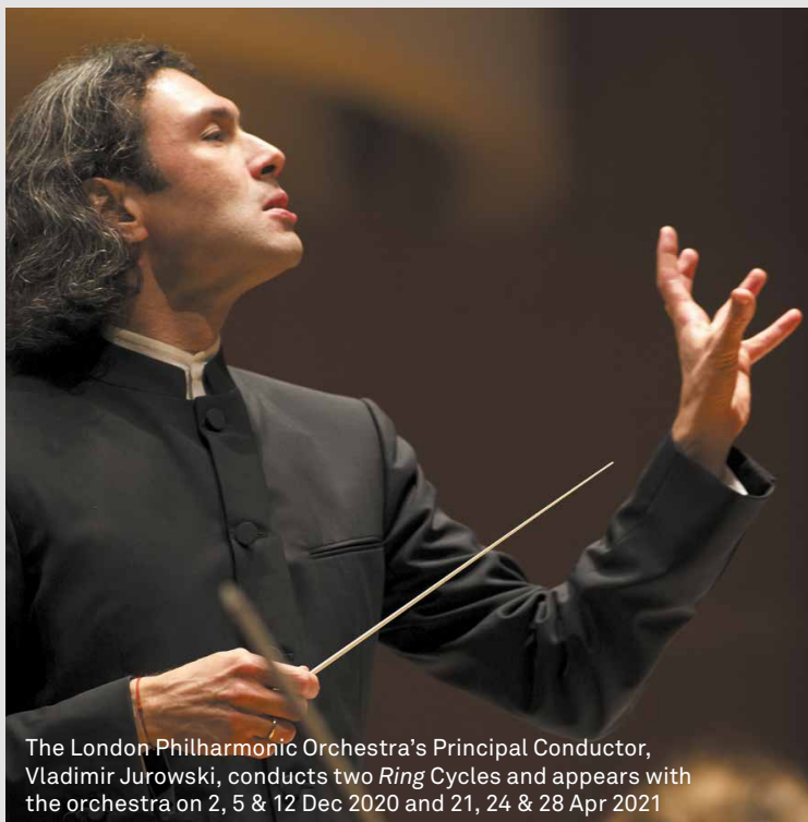
The London Philharmonic Orchestra's Principal Conductor, Vladimir Jurowski, conducts two Ring Cycles and appears with the orchestra on 2, 5 & 12 Dec 2020 and 21, 24 & 28 Apr 2021

Please note this performance lasts approximately 5 hours 30 minutes including one 20-minute interval and one 75-minute interval.