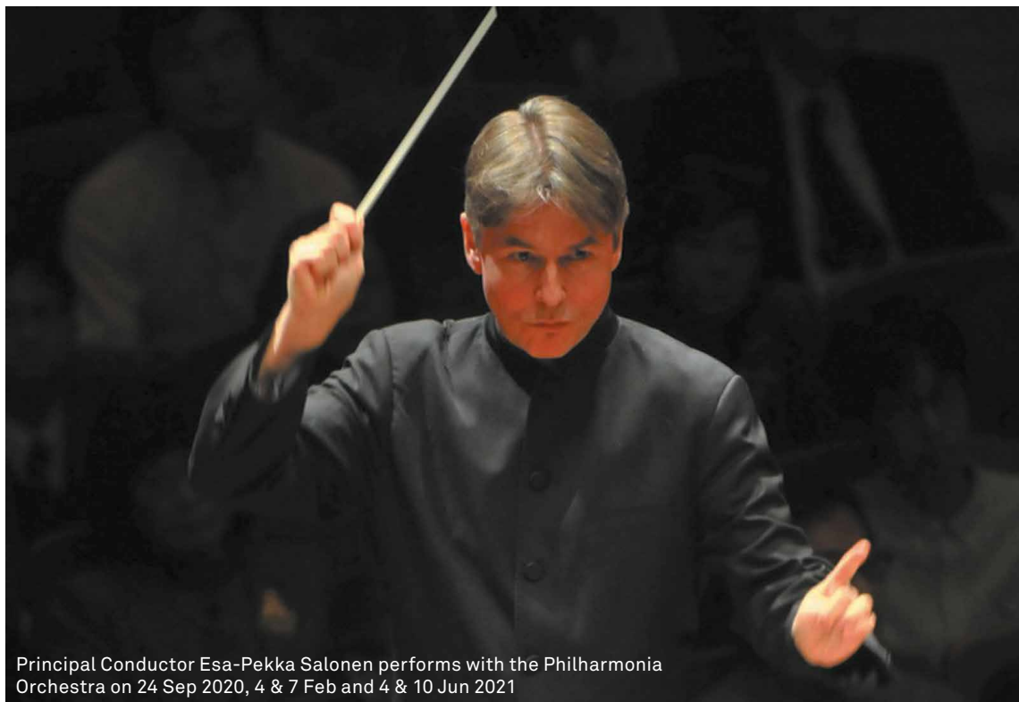
Principal Conductor Esa-Pekka Salonen performs with the Philharmonia Orchestra on 24 Sep 2020, 4 & 7 Feb and 4 & 10 Jun 2021