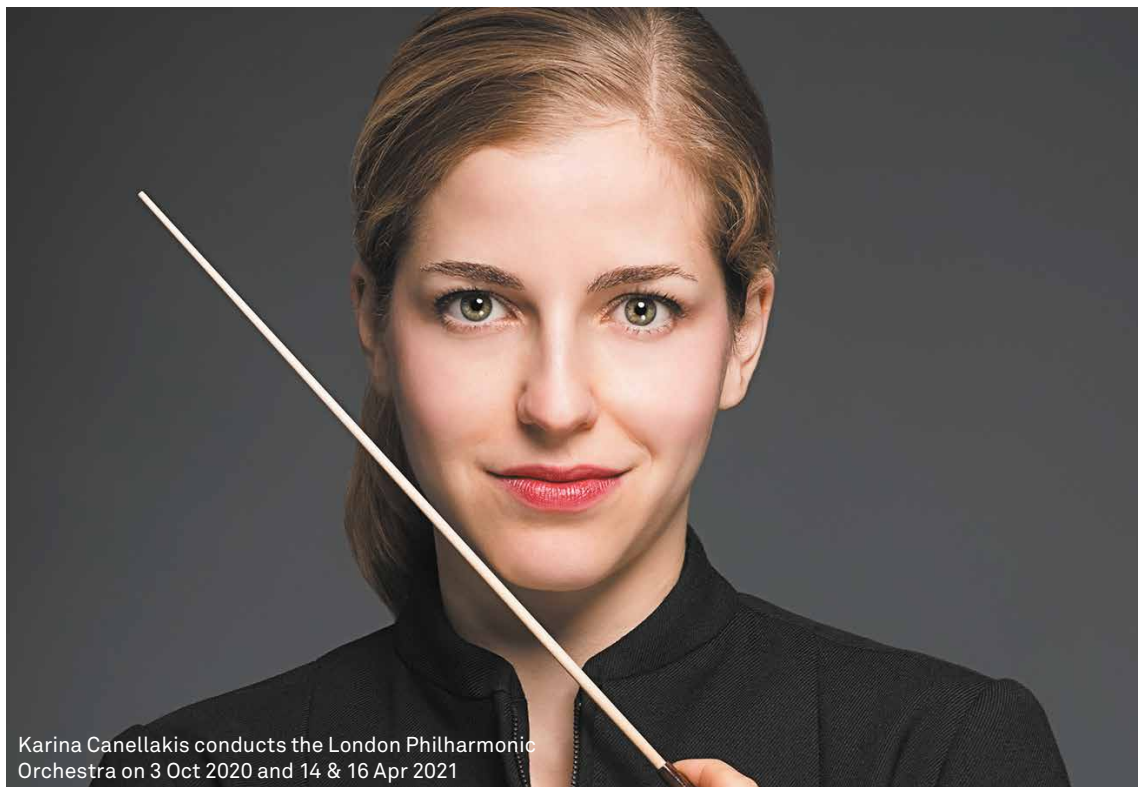
Karina Canellakis conducts the London Philharmonic Orchestra on 3 Oct 2020 and 14 & 16 Apr 2021