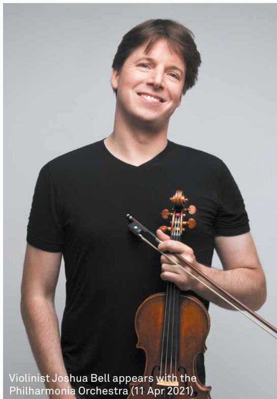
Violinist Joshua Bell appears with the Philharmonia Orchestra (11 Apr 2021)