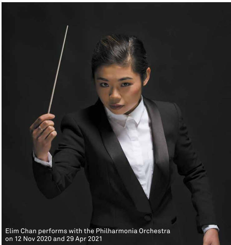
Elim Chan performs with the Philharmonia Orchestra on 12 Nov 2020 and 29 Apr 2021