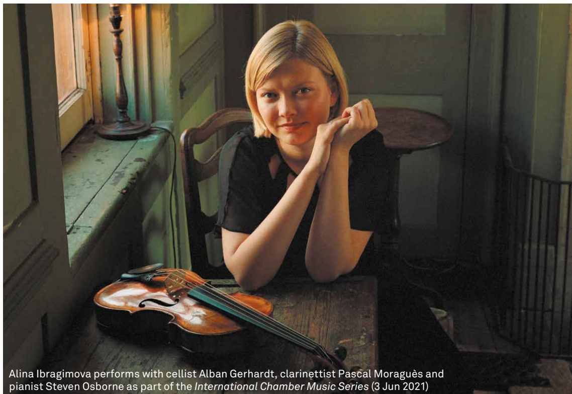
Alina Ibragimova performs with cellist Alban Gerhardt, clarinetist Pascal Moraguès and pianist Steven Osborne as part of the International Chamber Music Series (3 Jun 2021)