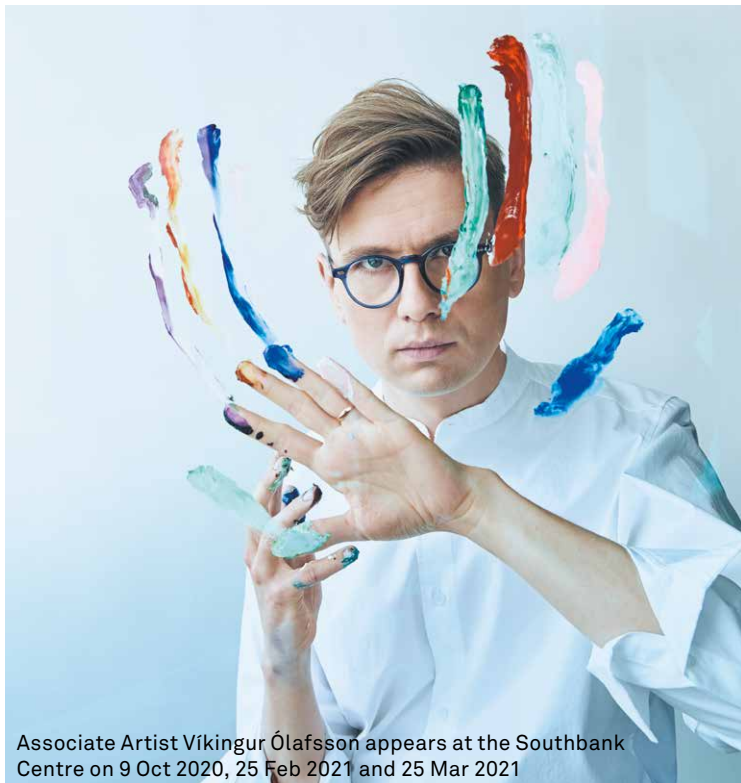
Associate Artist Víkingur Ólafsson appears at the Southbank Centre on 9 Oct 2020, 25 Feb 2021 and 25 Mar 2021