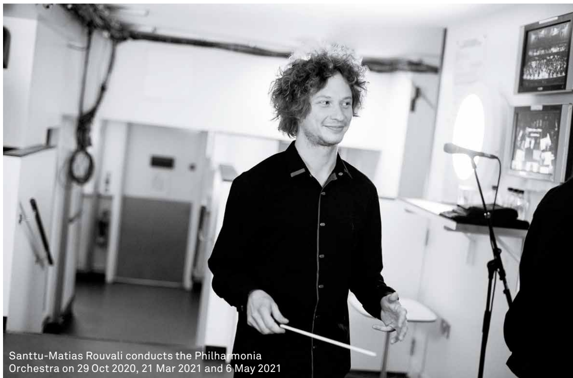
Santtu-Matias Rouvali conducts the Philharmonia Orchestra on 29 Oct 2020, 21 Mar 2021 and 6 May 2021