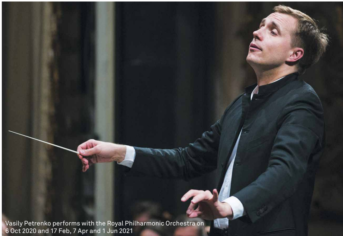
Vasily Petrenko performs with the Royal Philharmonic Orchestra on 6 Oct 2020 and 17 Feb, 7 Apr and 1 Jun 2021