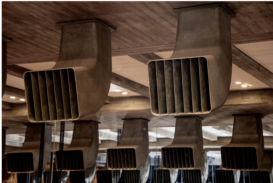
The Queen Elizabeth Hall vents

epic three-dimensional instrument. Made up of over 80 speakers which are concealed within the chambers, tunnels and vents surrounding the Queen Elizabeth Hall auditorium, Concrete Voids provides artists with enormous creative opportunities to create rich and complex sound-worlds for their performances. Using spatial audio solution TiMax panLab, sound sources can be moved and manipulated within the space, even by the artist as they perform.