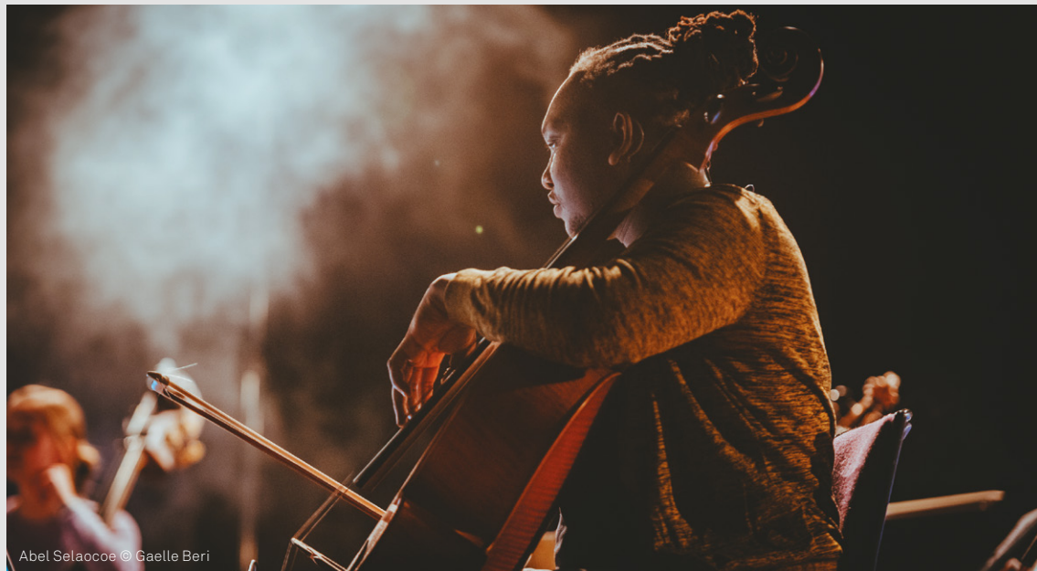
Abel Selaocoe

Our Alternative Experiences shine a light on artists who are creating new ways for us to experience classical music, whether that means inviting us to get closer to the performers, mixing mediums or blurring styles and genres.