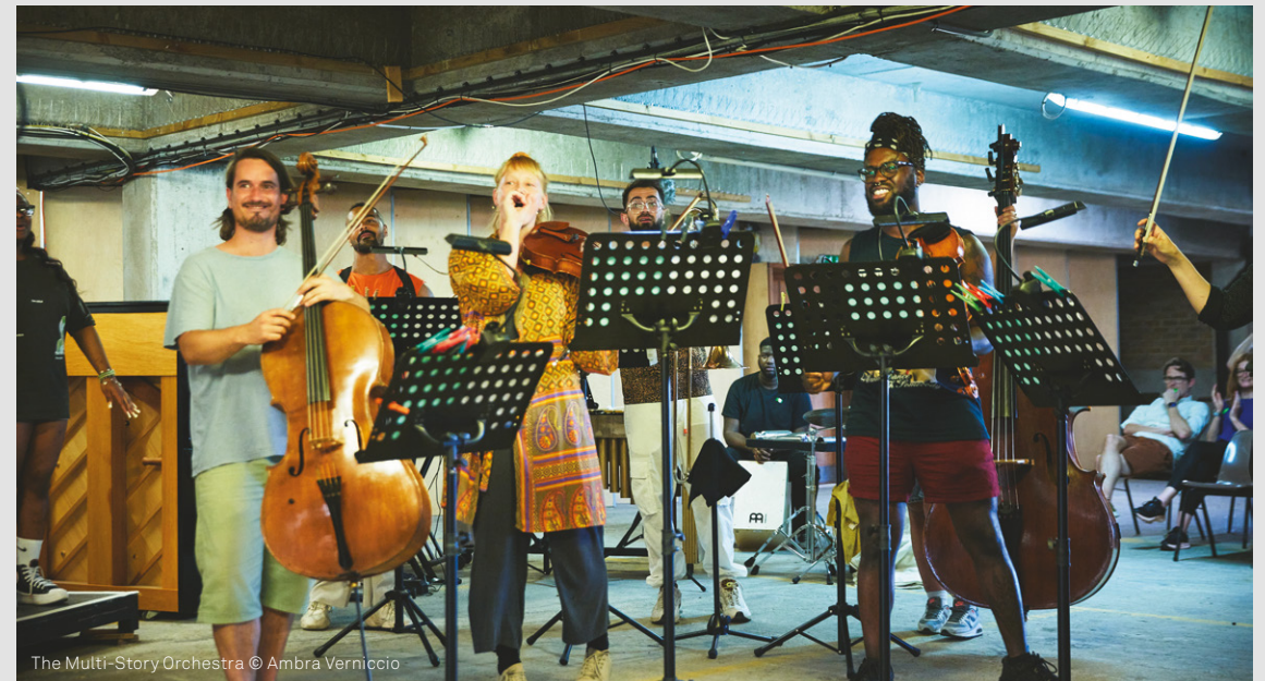
The Multi-Story Orchestra

There's no age limit for who can experience the magic of classical music, so get the whole family involved with immersive events and interactive performances featuring our Resident Orchestras and returning guest ensembles.