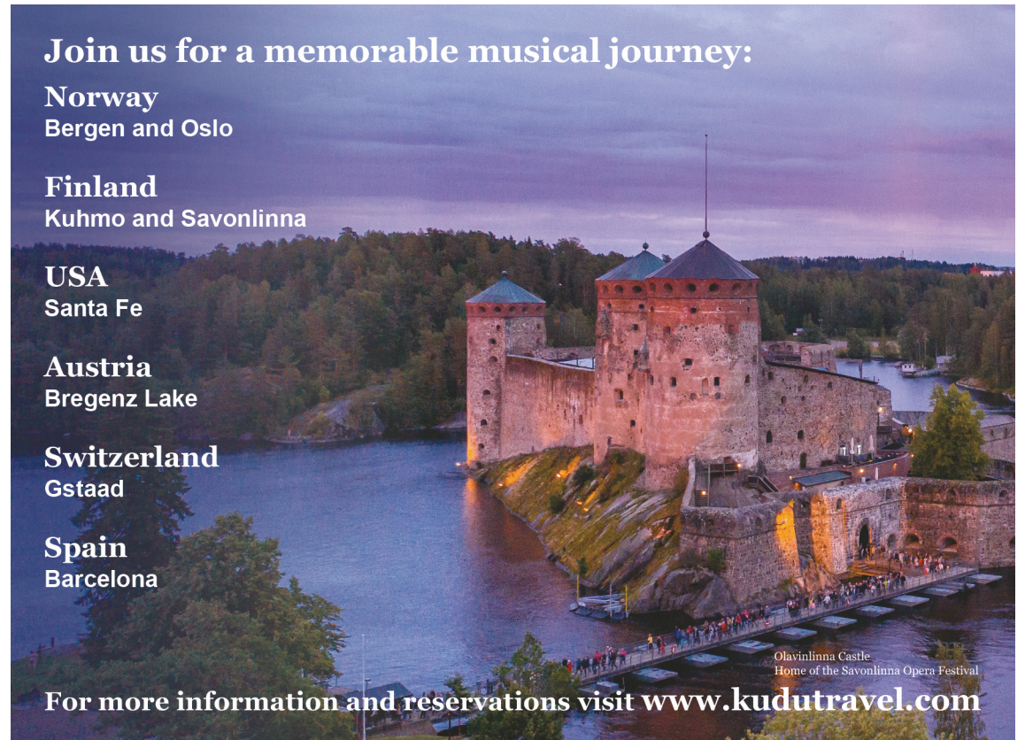
Olavinlinna Castle Home of the Savonlinna Opera Festival

For more information and reservations visit www.kudutravel.com