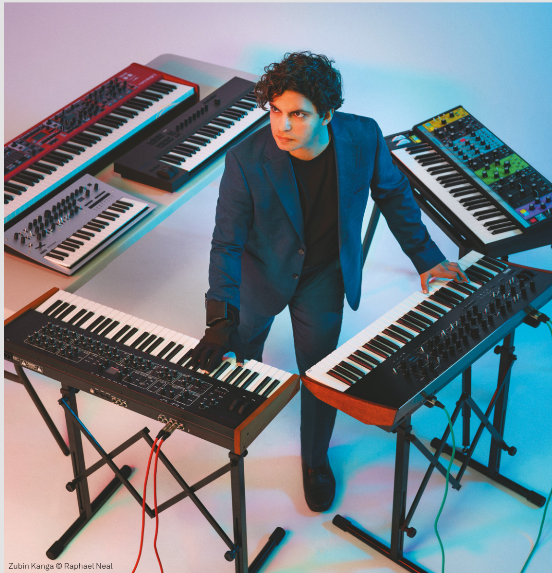
Zubin Kanga

Artists at the cutting edge of classical music take the spotlight in our Contemporary Edit , which features many of our Resident Orchestras and Resident Artists. Here is a place to discover pioneering voices of the 20th century, work that brings new technologies into play and boundary-pushing new commissions.