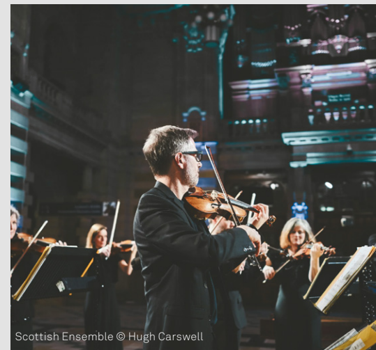
Scottish Ensemble