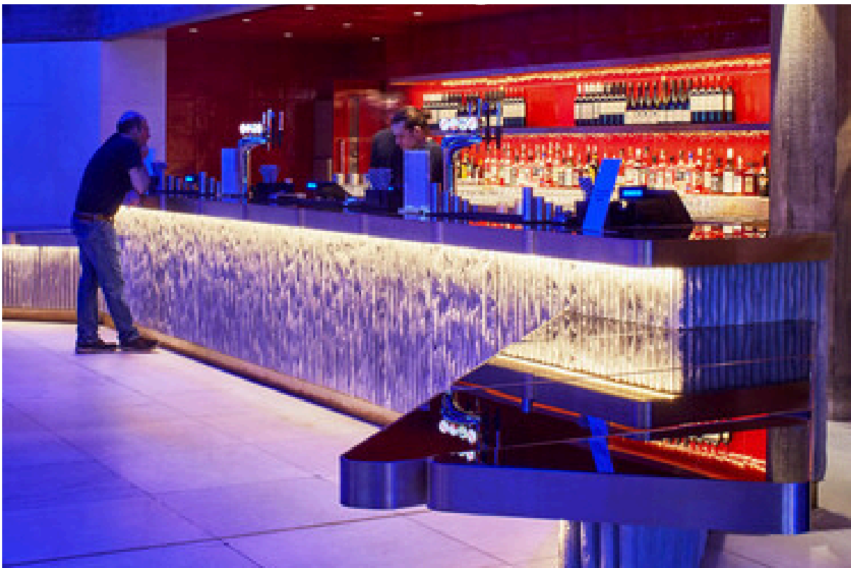
The long bar with a lower section for wheelchair user service.