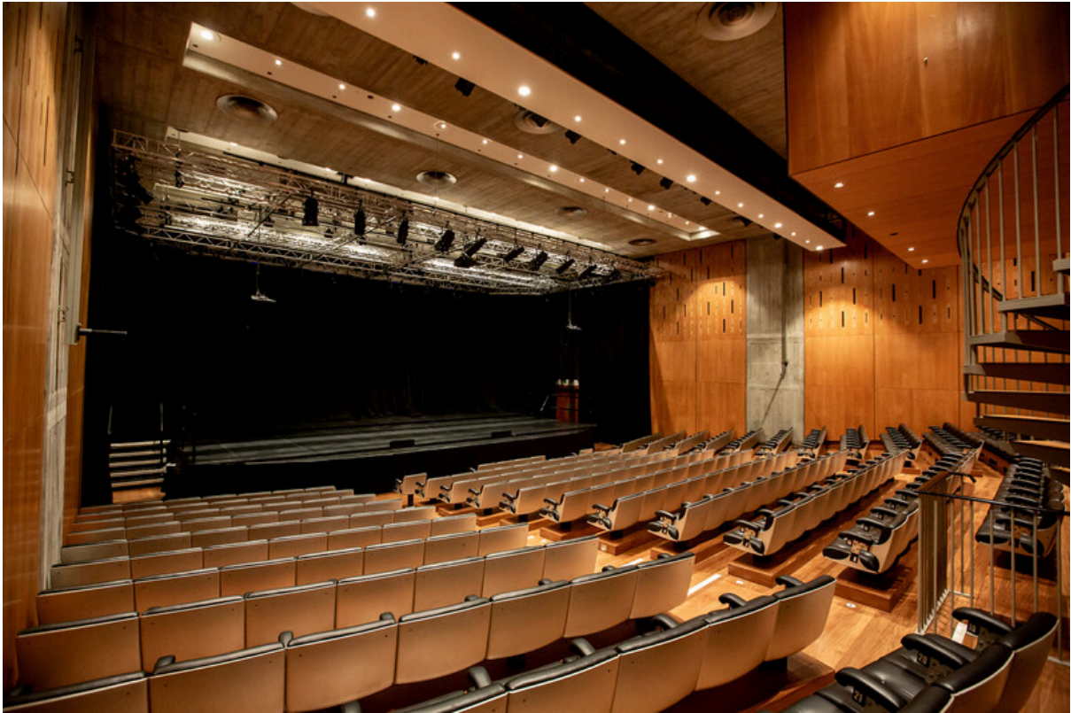
The Purcell Room: the breakout space