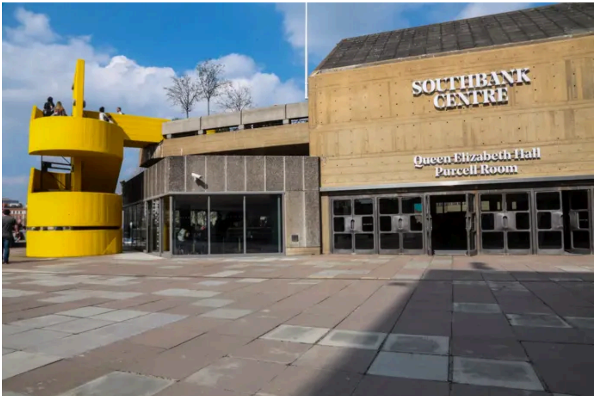
Doors into the venue.

The space is crescent shaped, with a long bar, toilet facilities and a cafe on one side, and a wall of windows on the inner crescent draped by a colourful curtain. The DJs will be positioned in front of the windows facing the bar and the doors out to the terrace. There are concrete pillars throughout the space, with triangular lighting overhead, as well as gentle club lighting throughout.