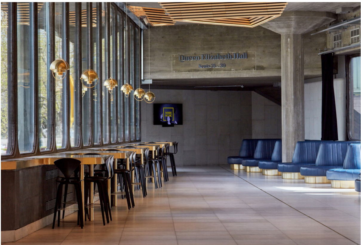
A view in daytime looking down to where the gaming station will be.