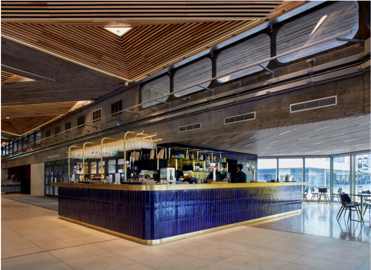
The smaller bar, next to the entrance doors.